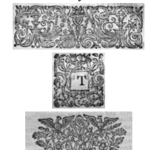
Figure 6: Ornaments of James Watson used in Whist.2.2 (scale varies).

in Wardrobe-Court, Great Carter-Lane" includes Vernon's Glory (1740) and The New Ministry (1742) both of which are "printed for W. Webb." <sup>43</sup>